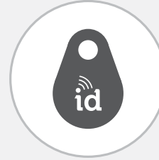
MSA id Tag