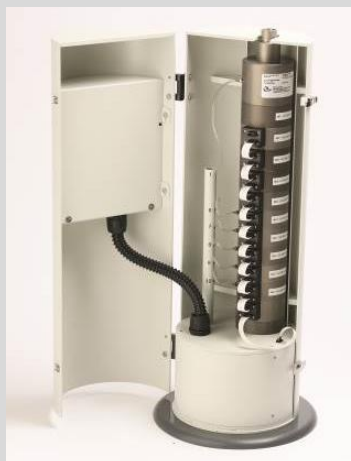
Model 120R 30 L/min 10 Stage MOUDI II impactor