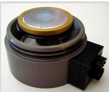
Figure 2. Typical stage with uniform deposit