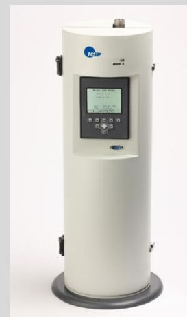
Model 125R 10 L/min 13 Stage MOUDI II impactor