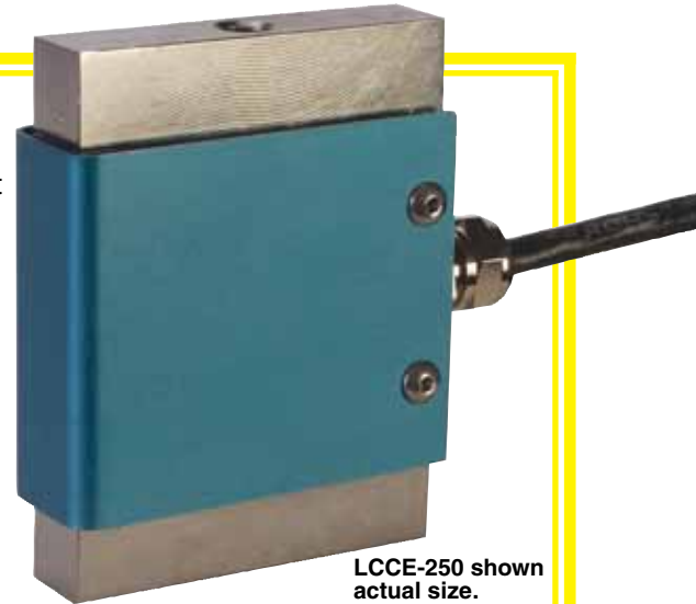
LCCE-250 shown actual size.

Excitation: 10 Vdc, 15V maximum Output: 3 mV/V \pm 0.25% full scale Calibration: 5 point NIST traceable in tension 0%, 50%, 100%, 50%, 0% Linearity: \pm 0.03% full scale Hysteresis: \pm 0.02% full scale Repeatability: \pm 0.01% full scale Zero Balance: \pm 1% full scale Creep in 20 minutes: \pm 0.03% full scale Operating Temperature: -18 to 65°C (0 to 150°F) Compensated Temperature: -18 to 65°C (0 to 150°F) Thermal Effects: Zero: \pm 0.0027% FS/°C Span: \pm 0.0014% rdg/°C Safe Overload: 500% capacity tension and compression Ultimate Overload: 500% capacity Bridge Resistance: 350 \Omega nominal Protection Level: IP67 Material: 17-4 PH SS element, aluminum side cover Electrical Connection: 6 m (20') 4-conductor 24 AWG jacketed cable