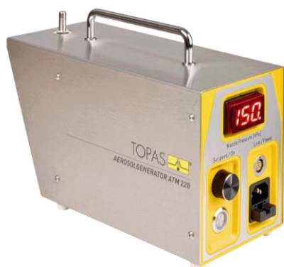
Atomizer Aerosol Generator ATM 228.

The operation of the ADD 536 requires an additional suitable aerosol generator (aerosol flow rate up to 5 L/min, particle generation rate > 6,3 \times 10^9 \text{ min}^{-1} ) and a suitable particle counter (sample flow rate of 2,83 L/min or 28,3 L/min).