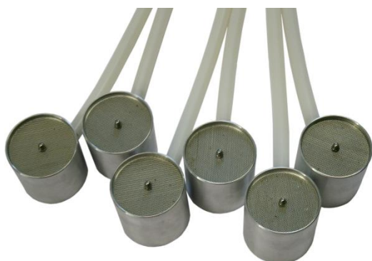
Aerosol vents with diffuser sieve for uniform aerosol outlet.