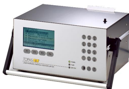
Particle Counter LAP 340.