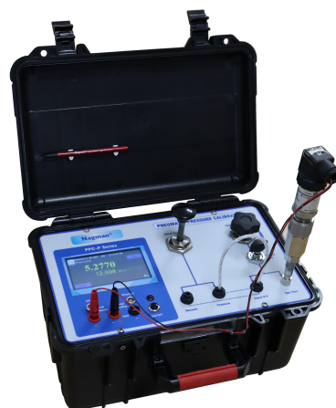
Table-top / Bench-top - Heavy Duty