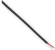
J type - FEP