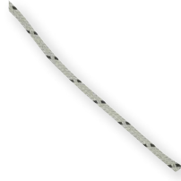
J type - FB