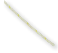
K type - FB